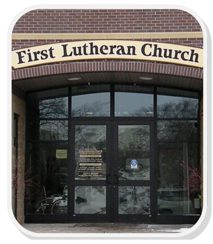
912 Lake Avenue Detroit Lakes, MN