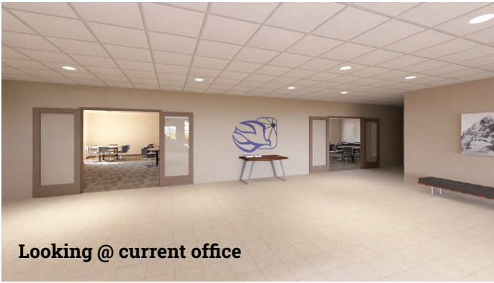
Looking @ current office