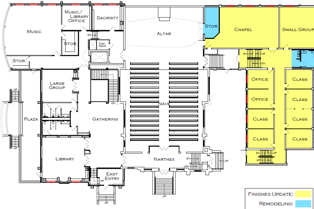
MAIN LEVEL PLAN