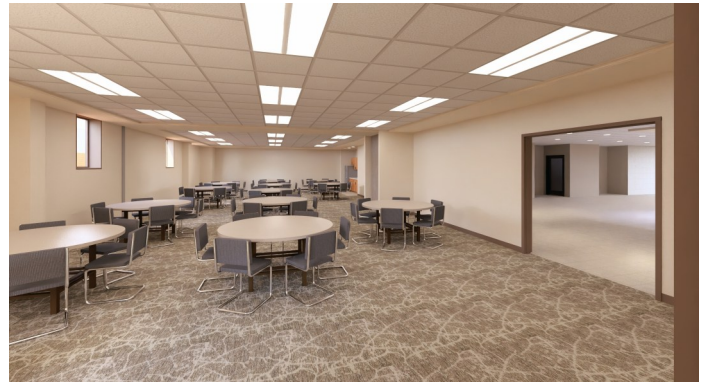
Fellowship expansion (current office area)