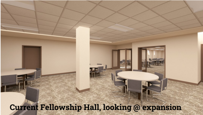
Current Fellowship Hall, looking @ expansion