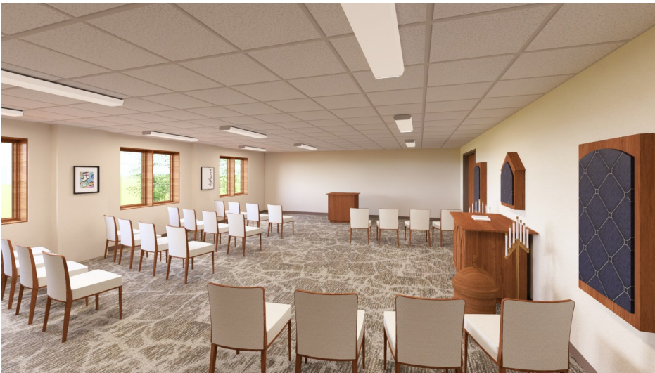
Current Ed Wing Chapel & Lounge